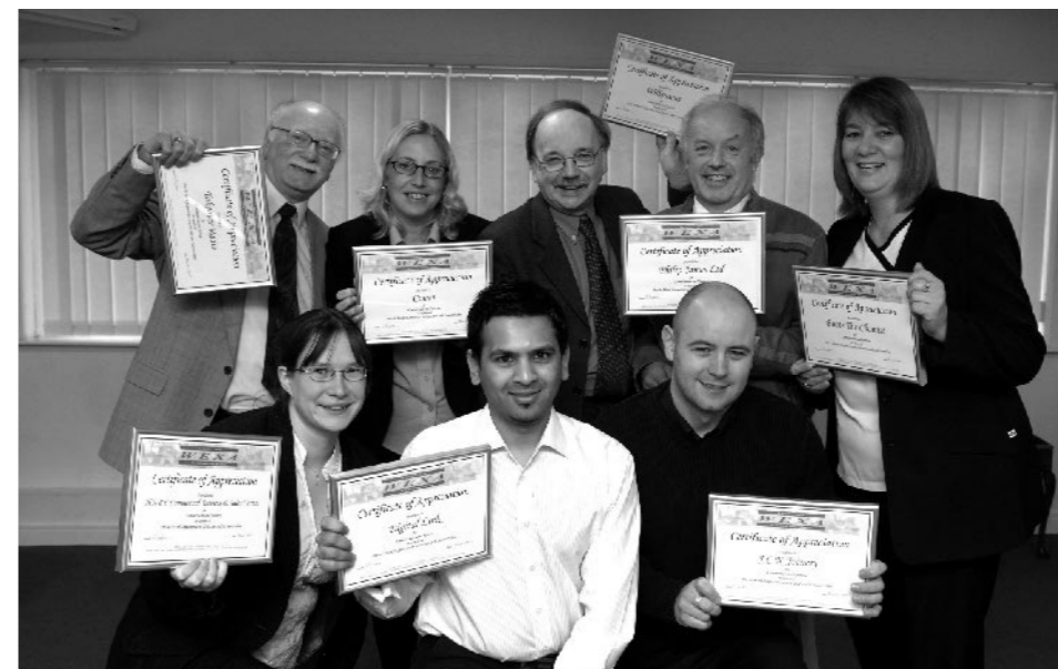
A selection of local employers with their certificates

With work experience set to form a compulsory component of the Diploma system as it evolves over the next 5 years, the challenge is to extend this level of employer commitment and support to an ever-wider range of local organisations. VESA will be working hard with LEBC, Connexions and its other key partners to address this "employer engagement challenge".